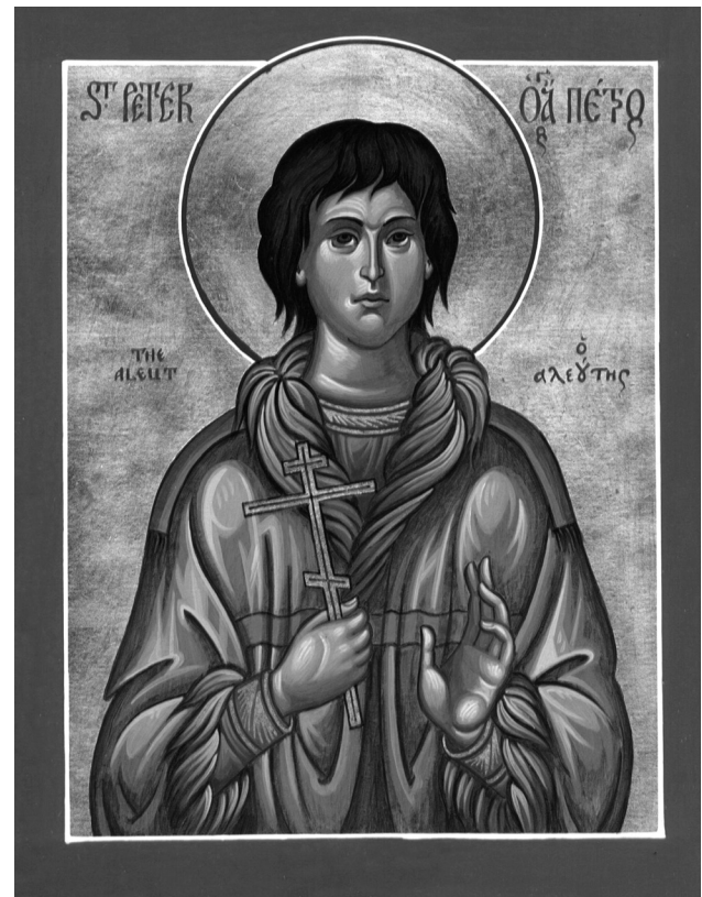
Figure 3. St. Peter the Aleut. Inscription is in English and Greek, as the icon was intended as a gift to the Kykkos Monastery in Cyprus.

It is ironic that through these acts of violence, which began with otter hunting trips to San Nicolas Island, two Native Americans—one a native of San Nicolas Island and the other a native of Kodiak Island—have become icons in contemporary culture, figuratively and literally.