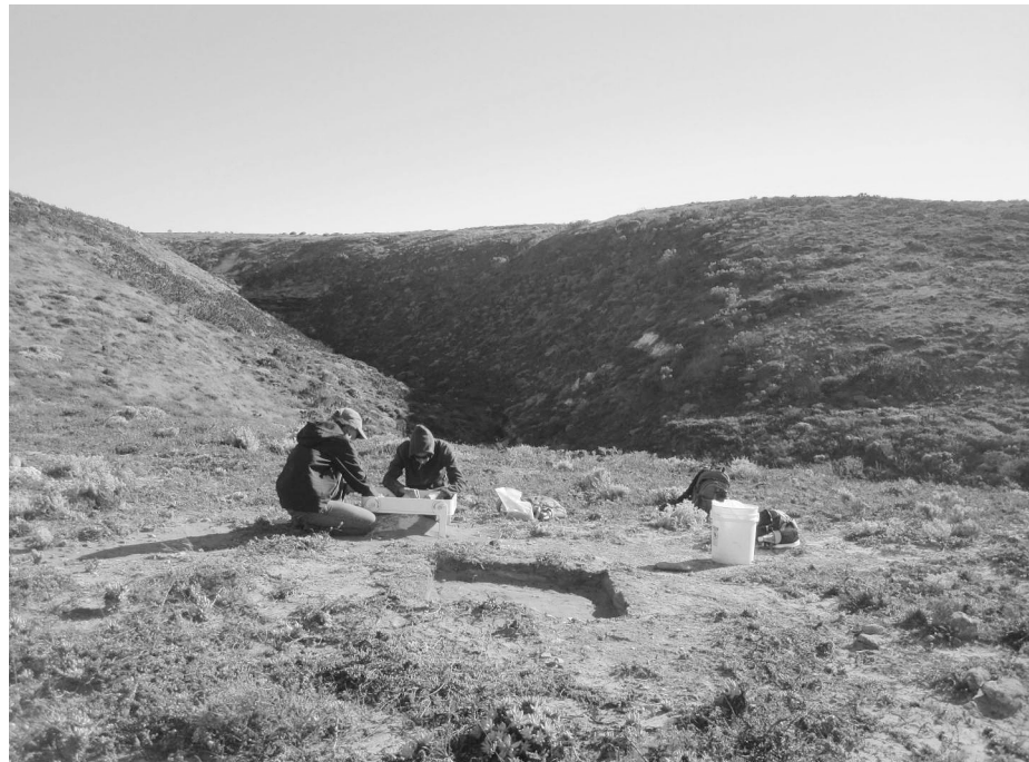
Figure 3. K. Gill (left) and A. Ainis screening sediments from the shallow Unit 1 excavated in the western portion of CA-SMI-274. The east fork of Willow Canyon is seen in the background (facing south, 2012).

To help further document the nature of this ancient and significant site, Erlandson, A. Ainis, and K. Gill excavated a shallow 1 x 1 m. test unit (Unit 1) atop the knoll in the western part of CA-SMI-274 (Fig. 3). Essentially a surface scrape, Unit 1 encountered just over 10 cm. of intact shell midden soil, producing 109 liters of sandy soil that was screened over 1/8-inch mesh in the field. Laboratory analysis of the screen residuals from Unit 1 produced 16 chipped stone artifacts, including one possible flake tool of siliceous shale and an assortment of non-diagnostic tool-making debris made from Tuqan/Monterey chert ( n=6 ), siliceous shale ( n=3 ), Cico chert ( n=4 ), and quartzite ( n=1 ). Also recovered were very small amounts of charcoal, one small fragment of red ochre that may or may not be of natural origin, and land snail ( Helminthoglypta ayresiana ) shells that are almost