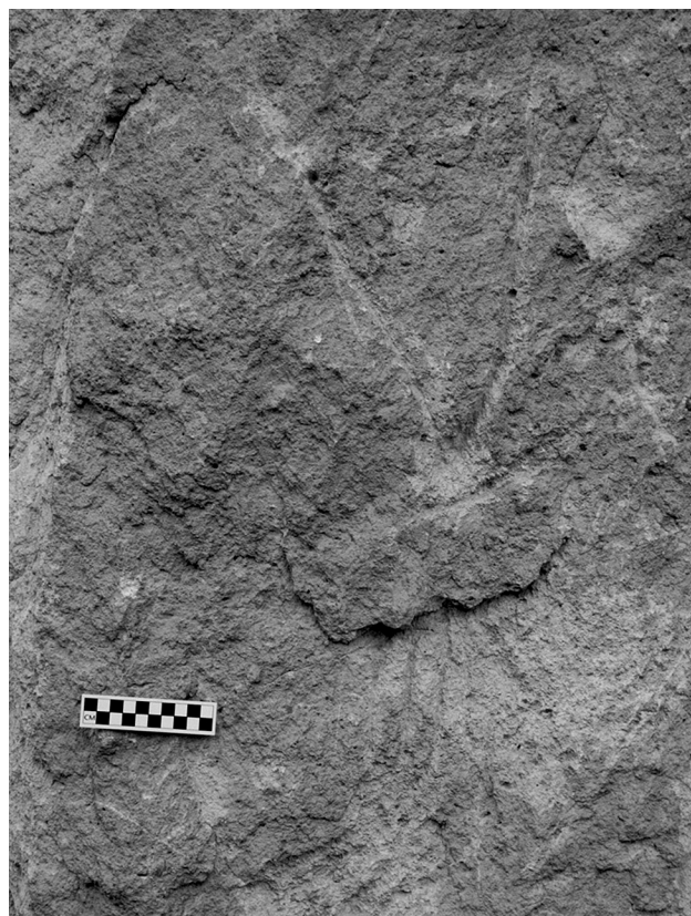
Figure 6. Scratched 'V' figure adjacent to Etna Cave.

support their indigenous authenticity. In form, at least two of the abstract curvilinear groups are reminiscent of the motifs found in the pictograph panel at nearby 26LN110, although the latter are much more elaborate.