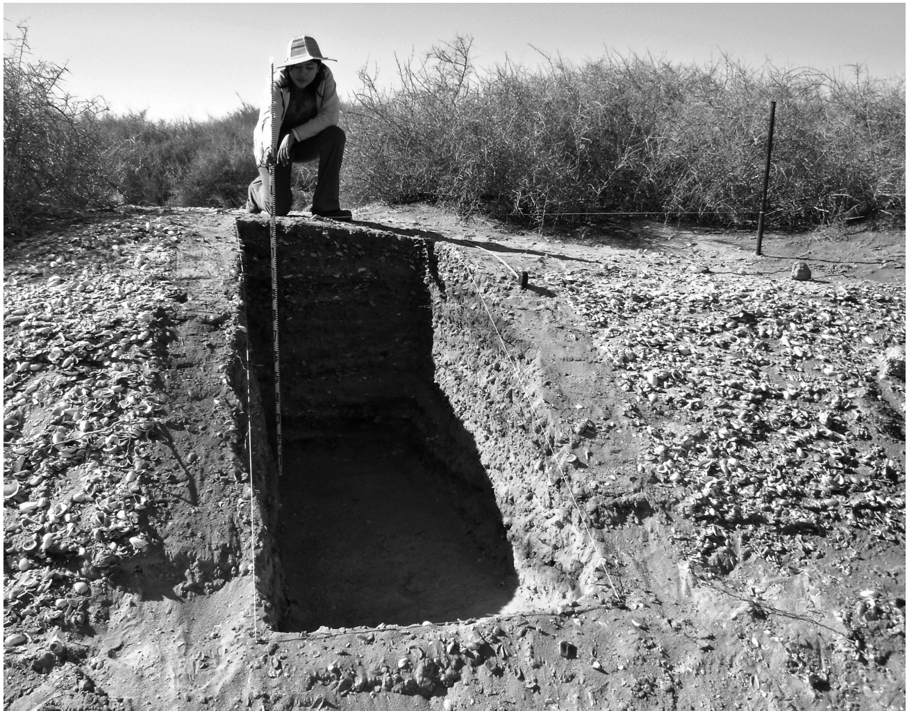
Figure 4. Trench 2 at the El Faro excavation.

obsidian, jasper, quartz, granite, and felsite. In the lower levels, the artifactual materials diminished substantially, with the exception of some small flaked andesite pieces.