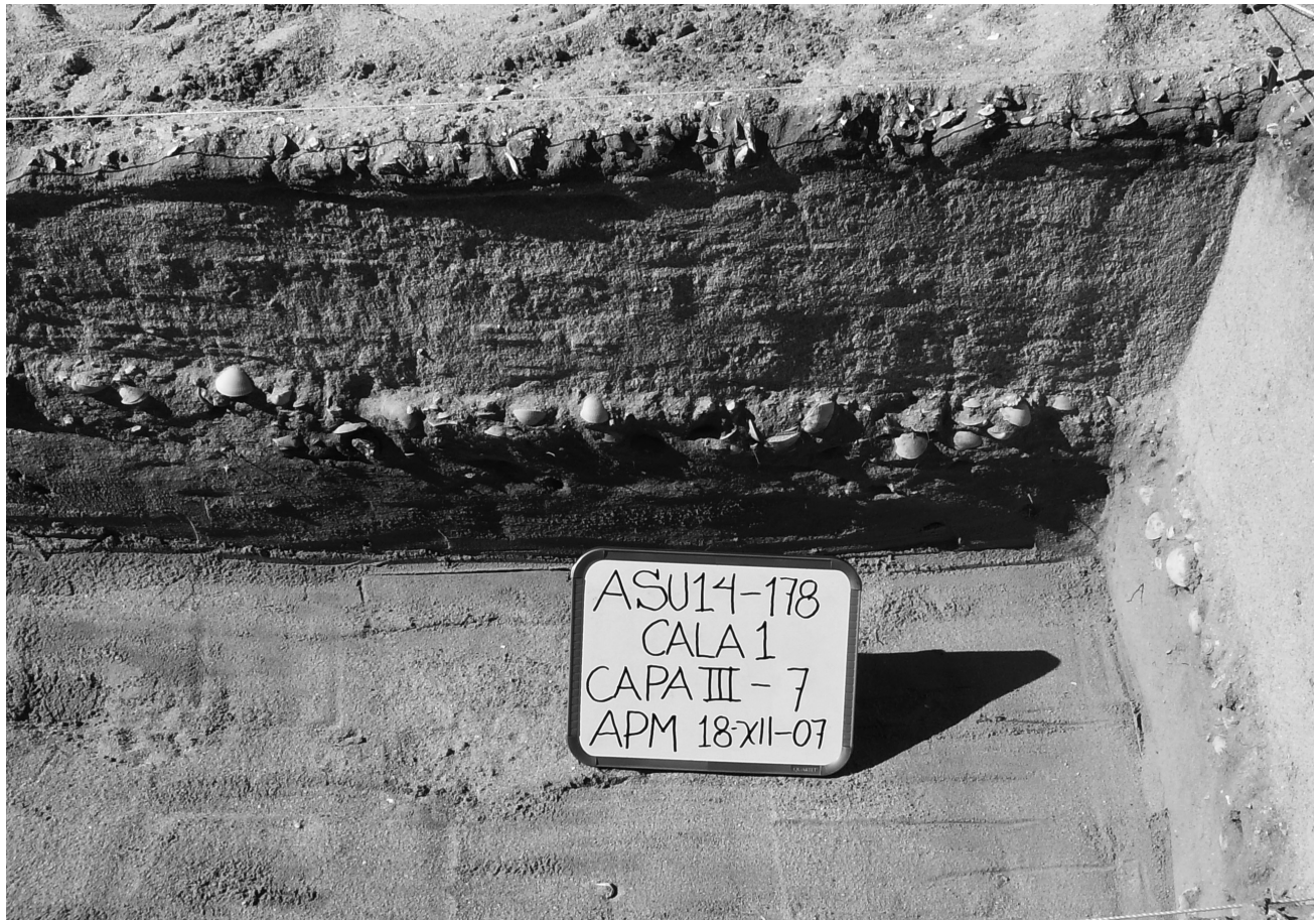
Figure 3. Trench 1 at the El Faro excavation.