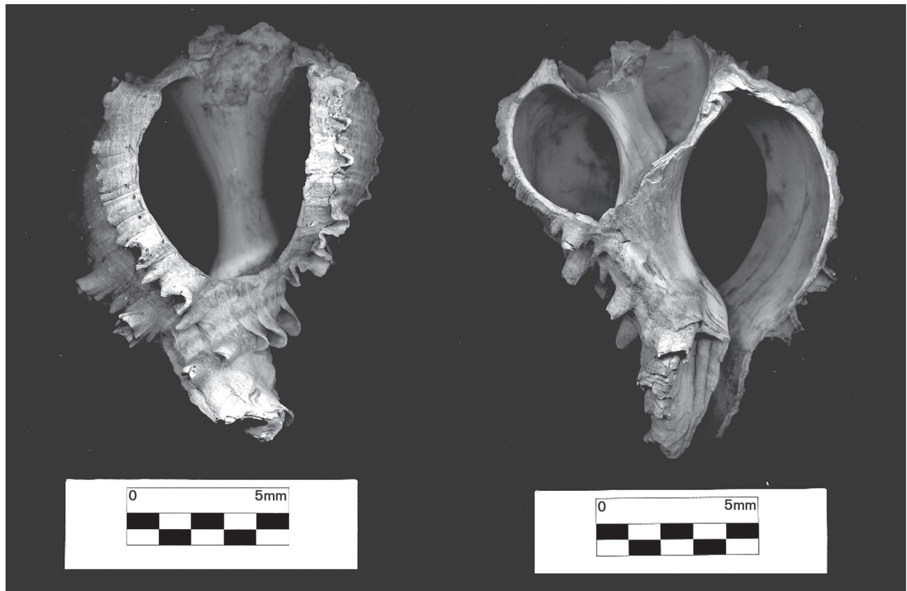
Figure 5. Hexaplex nigratus with evidence of meat extraction.

markers is needed to confidently show that sustained interaction occurred between the Baja Californian and the mainland Sonoran groups. At this point, the evidence suggests that the Kiliwa Indians and the earlier occupants at the El Faro site did not interact with groups across the Gulf on the western coast of mainland Mexico, once again hinting at the isolation of the Baja California settlers in the upper Gulf region.